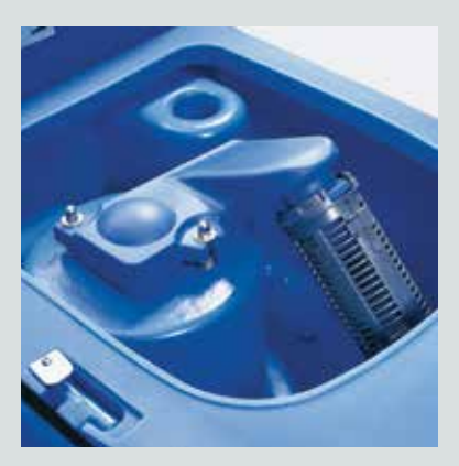
Easy access to clean the recovery tank