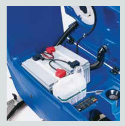
Optional chemical mixing system