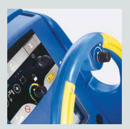
Ergonomic handle and easy to understand control panel